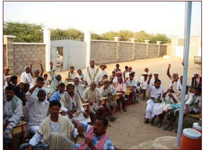
Meetings of selecting Lead Farmers