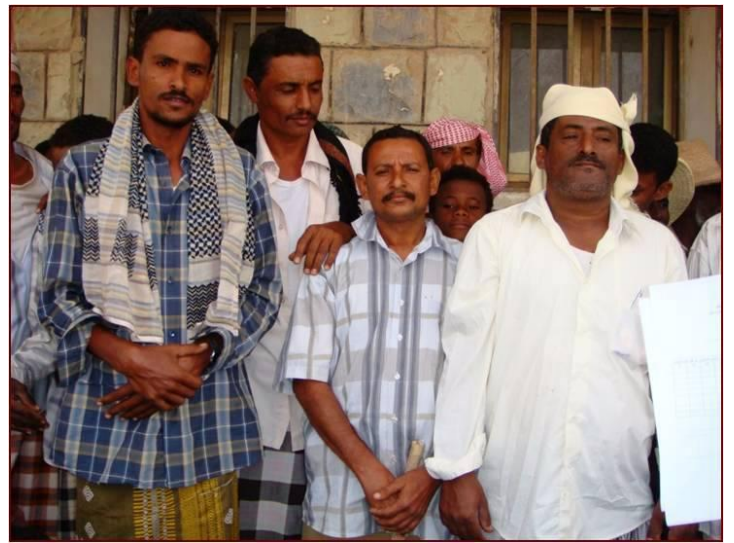
Some of selected Lead Farmers